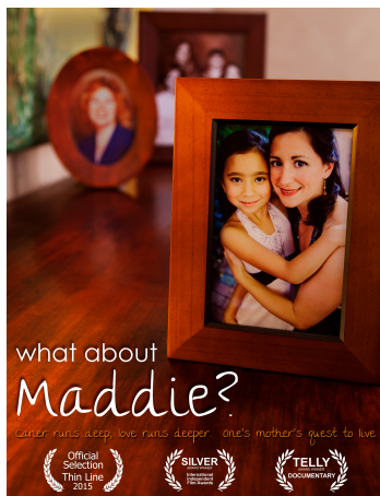
“What about Maddie?” Poster

To download Hi-Res images, go to: http://whataboutmaddie.com/press-2/